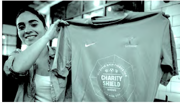
from pub . . .

Pool Round play leads to single-elimination Shield Rounds, in a day-long competition of fast-paced footie, food, friends, and post-tourney ceremonies, including the Shield Team and MVP Awards.