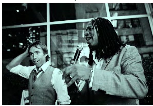
... to pitch!